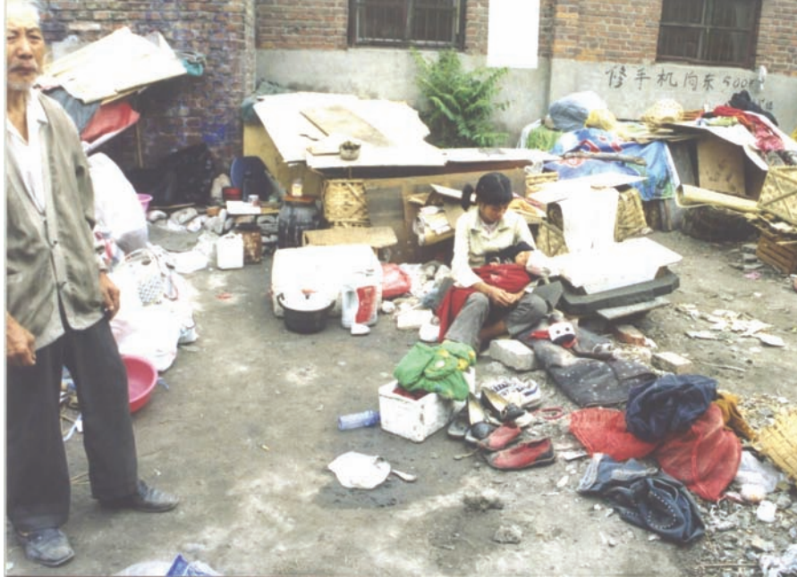
After years of futile attempts at redress, some petitioners wind up living on the streets.

Such petitioners say they suffer especially in Beijing's cold winters. A petitioner named Yang told Human Rights Watch: