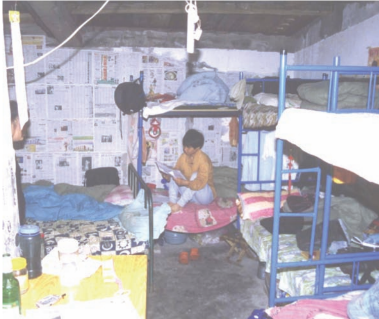
While they wait for their petitions to be addressed in Beijing, petitioners who have the economic resources stay in dormitories in the petitioners' village costing approximately U.S.$1.25 a day.

On arriving in Beijing to pursue their cases, petitioners with some resources may stay at guesthouses near government offices, or in dormitories in the petitioners' village that charge ten RMB [approximately U.S.$1.25] per night. These facilities may be clean, have relatively new beds, and include communal cooking areas.