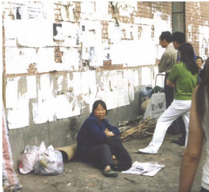
Petitions posted outside the Chinese Supreme Court building in Beijing.

Once in Beijing, many petitioners travel from bureau to bureau, trying their luck at each. One website lists over fifty petitioning offices at various ministries and government organs in Beijing alone. 36 According to the Chinese Academy for Social Sciences survey, petitioners interviewed had visited an average of six different bureaus in Beijing, while some have been to as many as eighteen. These included the National Bureau of Letters and Visits, the State Council, the Supreme Court, the Communist Party Central Disciplinary Commission, the Public Security Bureau, the Supreme People's Procuratorate, the National Bureau of Land Resources, the Agriculture Bureau, and the Civil Administration Bureau. 37