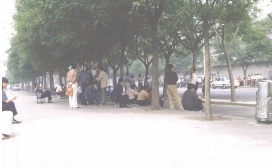
In Beijing, retrievers ( jiefang rennyuan ) wait across the street from petitions offices to forcibly return petitioners home.

Petitioners told Human Rights Watch that provincial and local authorities send “retrievers” [ jiefang rennyuan ] to Beijing to either discourage people from their province from petitioning, or to detain them and bring them back. 135 In many cases, arrests are conducted with the assistance of Beijing police. These arrests are often carried out with violence. After they are taken back to the home province, many petitioners are arbitrarily detained without trial in facilities where they face the risk of torture and the certainty of lengthy sentences of forced labor.